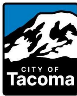
Mayor Victoria Woodards, City of Tacoma